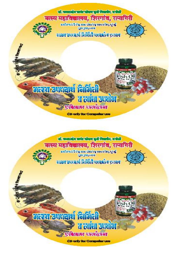
E - Book