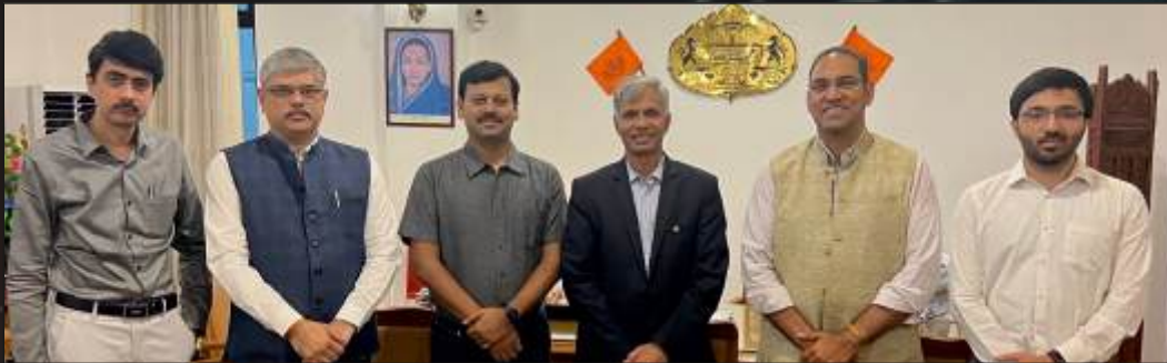
Savitribai Phule Pune University (SPPU)

In a bid to fortify Pune city's position as a Centre of Excellence for cybersecurity, Savitribai Phule Pune University (SPPU) has offered its support to the cybersecurity initiative. Leveraging SPPU's stature as the city's premier educational institution with a wide network of affiliated colleges, this collaboration holds significant promise. Discussions between MCCIA and SPPU have outlined several avenues for collaboration, setting the stage for a fruitful partnership.